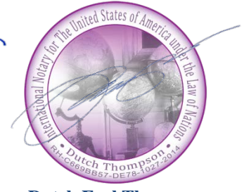
Dutch Earl Thompson