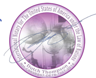
Dutch Earl Thompson