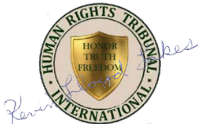
Minister Kevin Lloyd Lakes